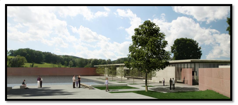
Figure 1: Rendering of the new addition

The sterling and Francine Clark Art Institute new addition consists of high end art galleries and research labs located in Williamstown, MA. The growing number of students and the fact that the museum became well known in the world of art were the reasons of the need to build a new addition the existing building. The addition of this new facility costs $28 million where Turner Construction is the General Contractor on the project. The state of the art new addition is design by the famous Japanese Architect Tadao Ando. It is made up of one floor and a basement and has a size of 68,000 SQF. The construction of the project started on January 2011 and scheduled to complete on September 2013 with a design bid build delivery (DBB) method and a guaranteed maximum price (GMP) contract.