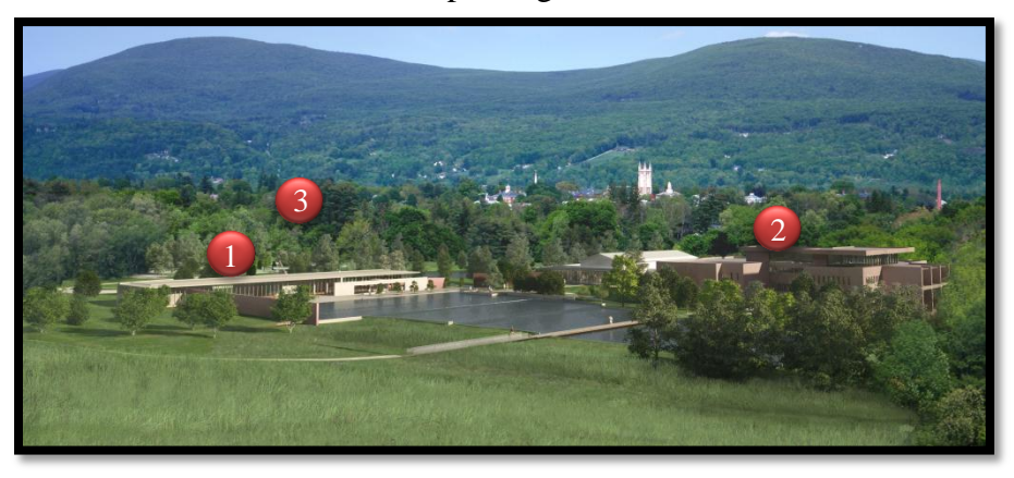
Figure 2: New addition location in respect with surroundings

The site for the new addition is relatively not constraint where it is next to an existing building called the Manton and the main parking lot. In figure 2, mark 1 shows a rendering of the new addition, 2 shows the Manton, and 3 for the parking lot.